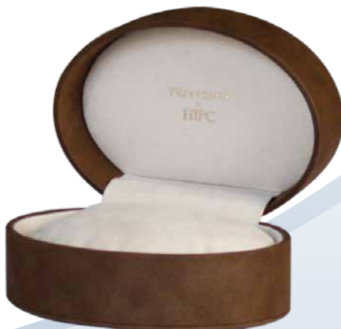
* X17 DEEP BANGLE CASE LIFT OUT CUSHION BASE INSERT.