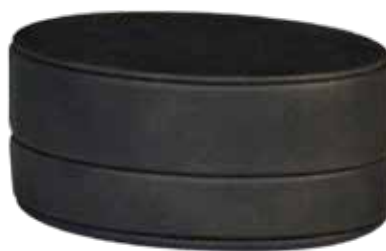
* X03 PENDANT CASE WITH BASE LIFT OUT PAD SLIT TO HOLD PENDANT.