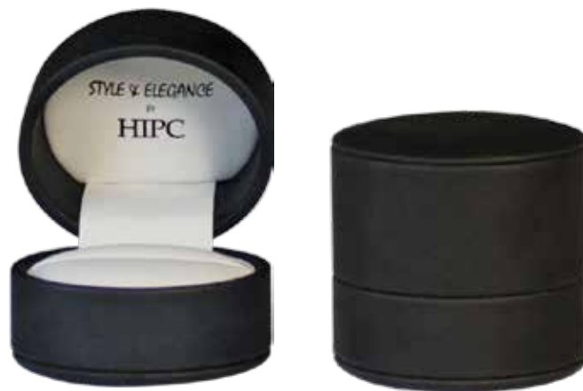
* X10 LARGE SINGLE RING CASE SOFT ROLL INSERT FIXED IN BASE.