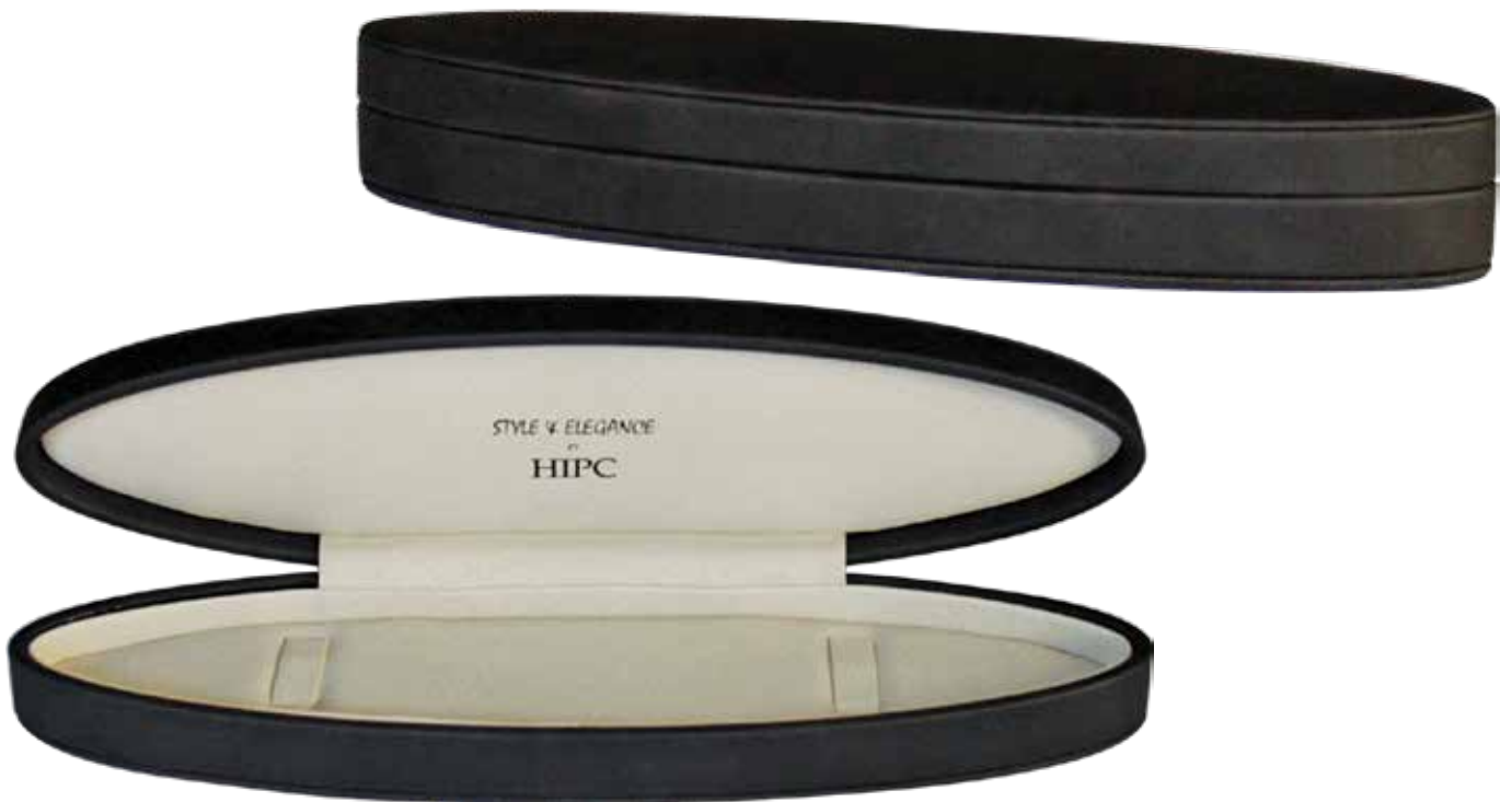
* X07 BRACELET CASE WITH INNER FIXED BASE PAD WITH TWO TINS TO HOLD BRACELET IN PLACE.