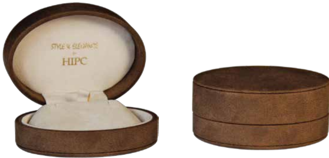
* X05 EARRING CASE LANDSCAPE WEDGE LIFT OUT INNER BASE PAD. SLIT TO HOLD EARRINGS.