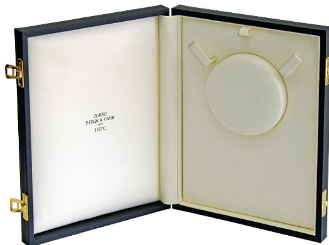
* SC006 - 1 ON NECKLACE CASE