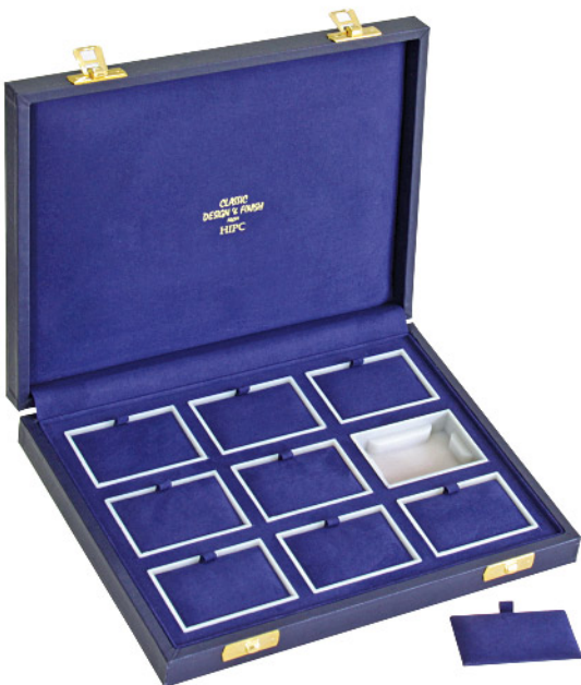
* SC003 - 9 ON EARRING PIN CASE

Each stock case comes packed individually in a white tuck end carton.