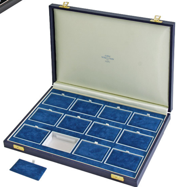
* SC021 - 12 ON BROOCH CASE