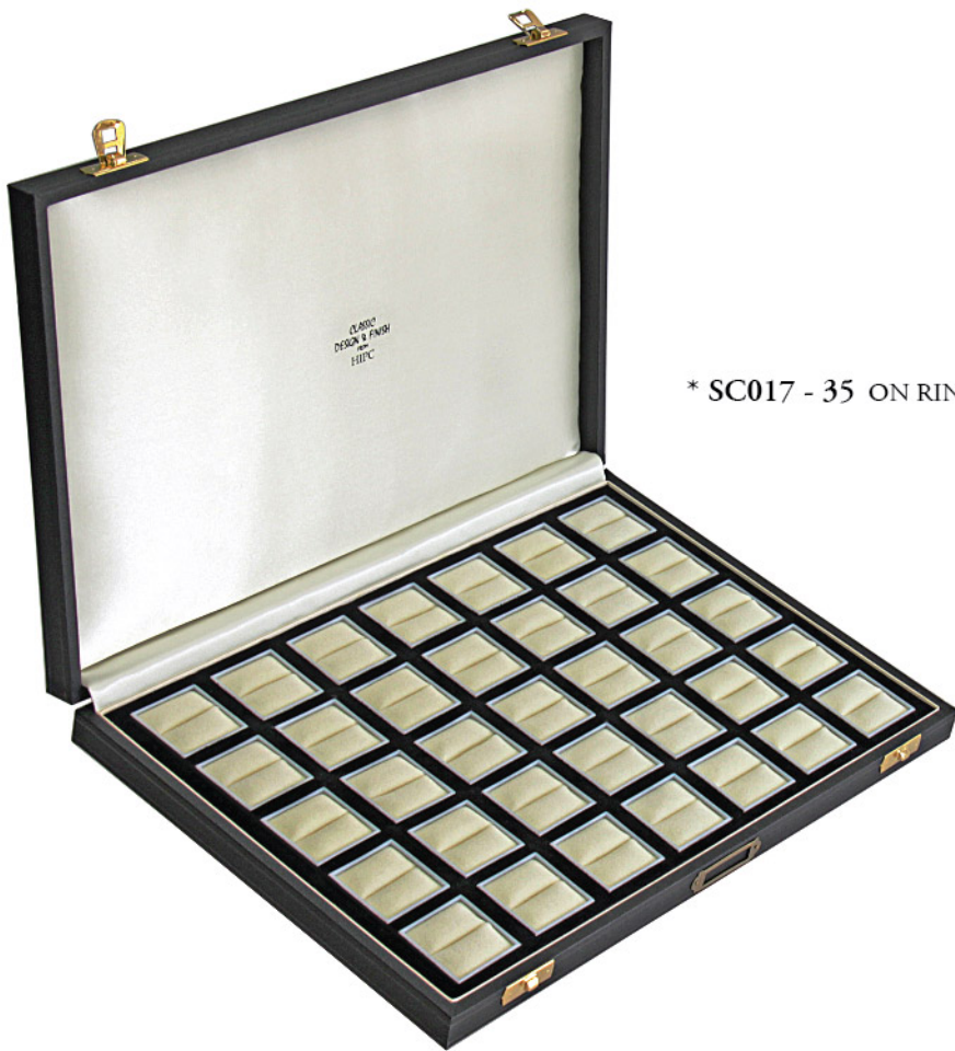
* SC017 - 35 ON RING CASE