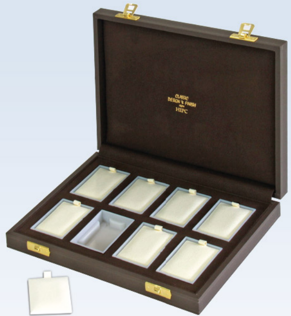
* SC002 - 8 ON EARRING PENDANT CASE