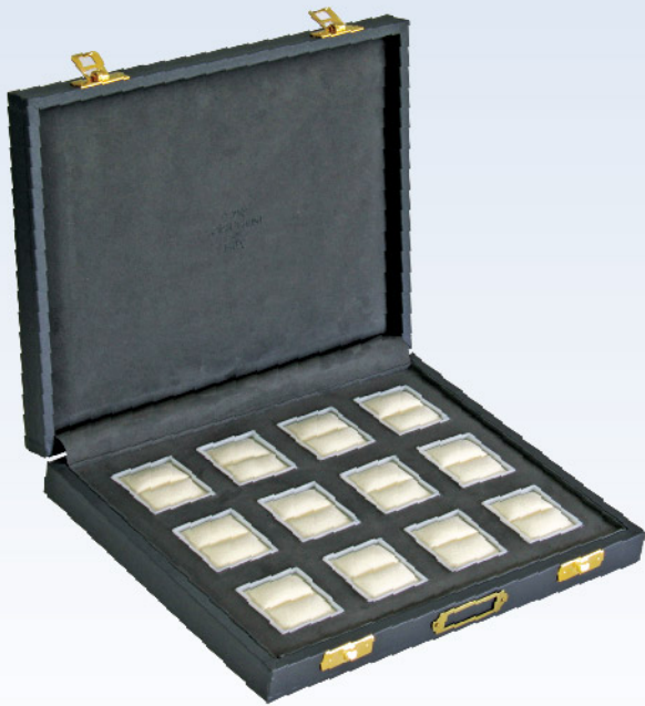
* SC001 - 12 ON RING CASE