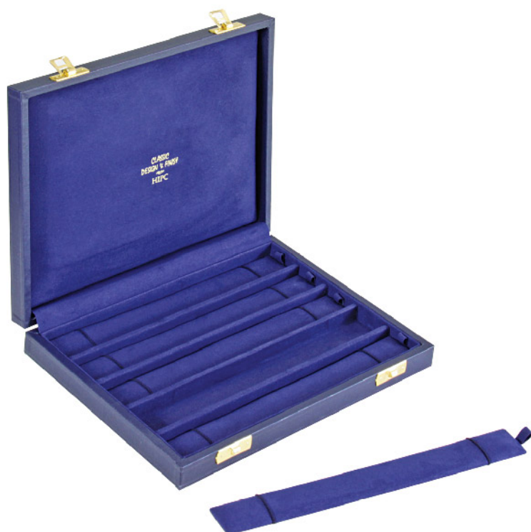
* SC005 - 5 ON BRACELET CASE