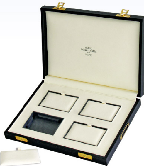
* SC004 - 4 ON BROOCH CASE