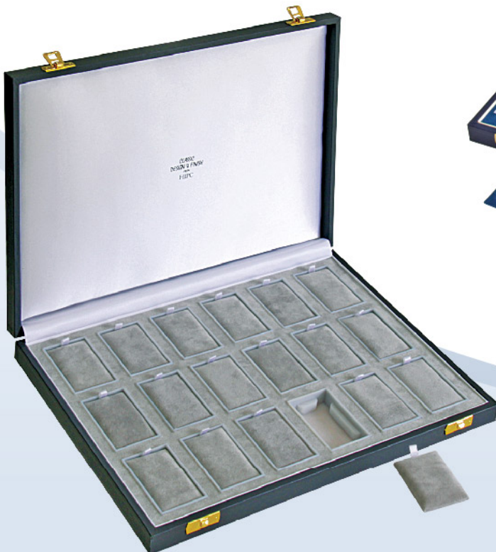
* SC018 - 18 ON EARRING PENDANT CASE