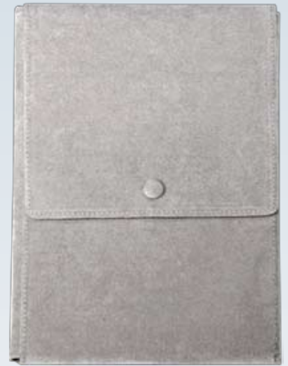
PN 001 Necklace Wrap (As viewed when closed)

Please refer to the Necklace Wrap information sheet enclosed for details relating to sizes available in each Necklace Wrap design.