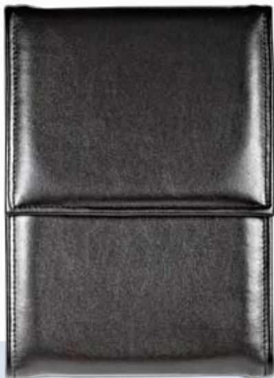
PF 001 Necklace Wrap (As viewed when closed)

Details on fabric and material options for Necklace Wraps are contained in the Necklace Wrap information sheet enclosed.