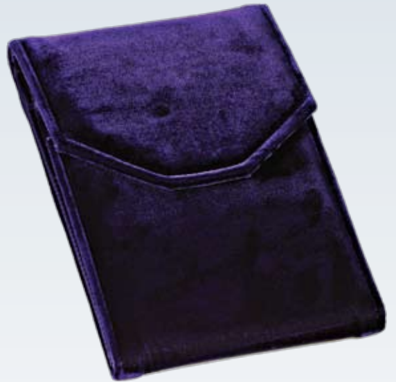
PW 001 Necklace Wrap (As viewed when closed)

Details on fabric and material options for Necklace Wraps are contained in the Necklace Wrap information sheet enclosed.