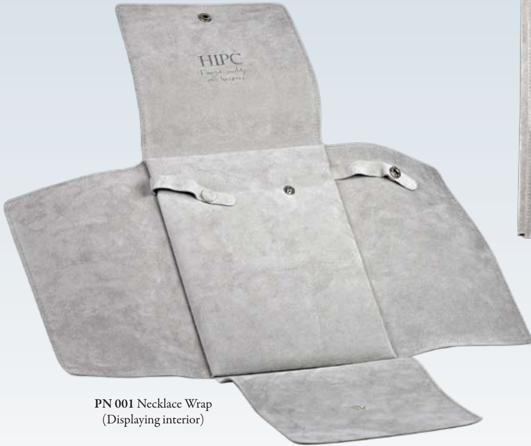
PN 001 Necklace Wrap (Displaying interior)