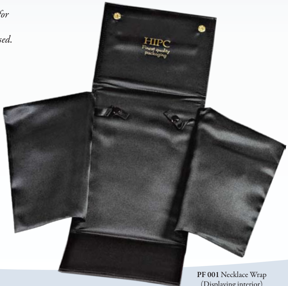
PF 001 Necklace Wrap (Displaying interior)