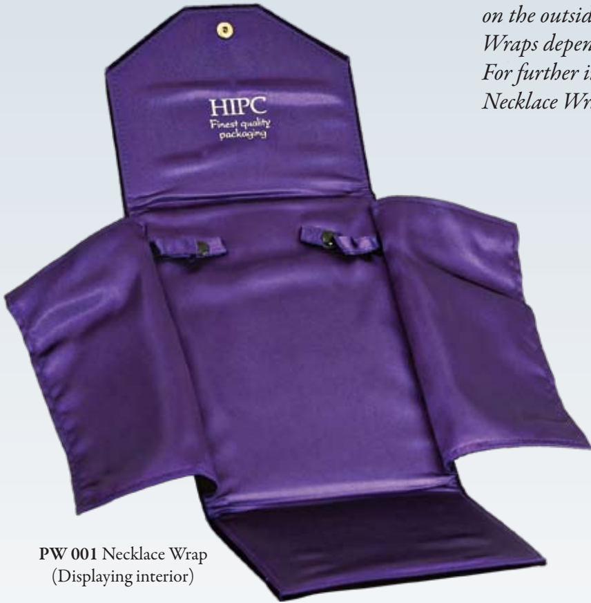
PW 001 Necklace Wrap (Displaying interior)

Logos and other details can be printed both on the outside and inside of the Necklace Wraps depending on the material make up. For further information please refer to the Necklace Wrap information sheet enclosed.