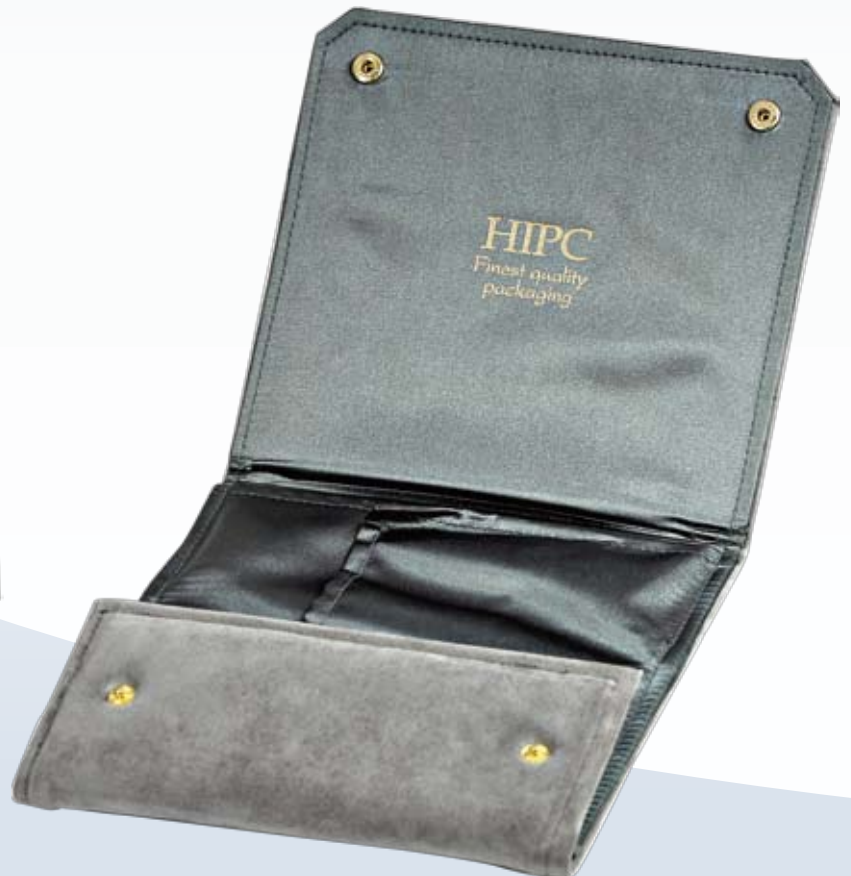
PC 001 Necklace Wrap (Part unfolded)