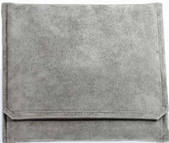
PC 001 Necklace Wrap (As viewed when closed)

Please refer to the Necklace Wrap information sheet enclosed for details relating to sizes available in each Necklace Wrap design.