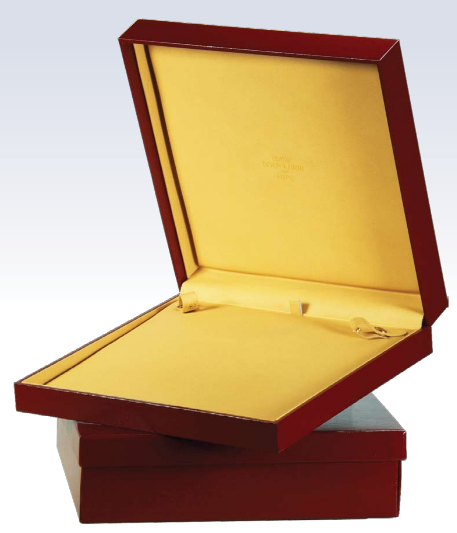
* BIJ014 LARGE NECKLACE CASE