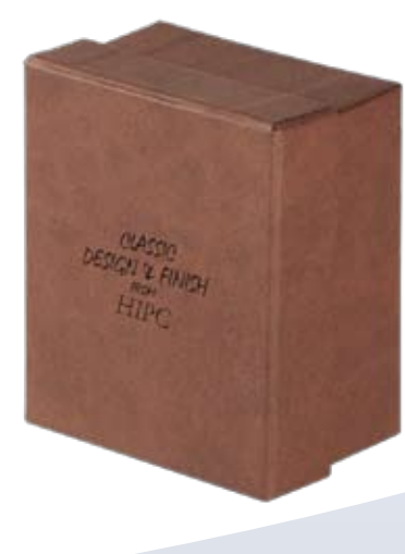
* BIJ009 WEDGE EARRING CASE

Please refer to enclosed interior insert design sheet for information relating to case size & insert types available.