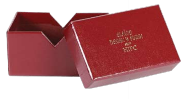
* BIJ007 DOUBLE RING CASE INSERT SOFT ROLL

Tooling can be applied if required, just refer to the enclosed tooling reference sheet for design options. Tooling can be applied in gold or silver, other colours are available. Please refer to the print colour swatch board information sheet.