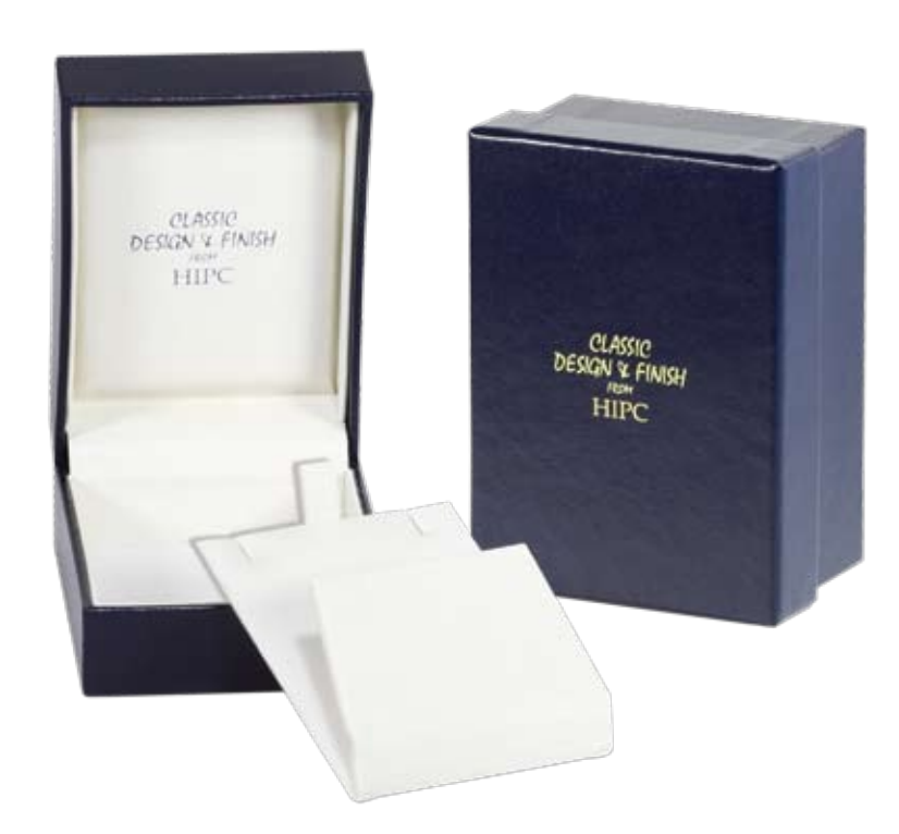
* BIJ008 PENDANT/FLAP EARRING CASE

Tooling can be applied if required, just refer to the enclosed tooling reference sheet for design options. Tooling can be applied in gold or silver, other colours are available. Please refer to the print colour swatch board information sheet.