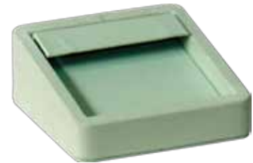
WEDGE STYLE EARRING DISPLAY TO HOLD SINGLE PAIR EARRINGS

* JAD 060 165mm x 100mm x 48mm sloping to 20mm