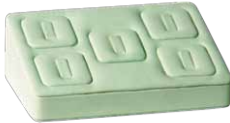
WEDGE STYLE RING DISPLAY TO HOLD FIVE RINGS BY TOP CLIPS