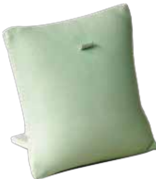
CUSHION WITH LOOP TO TAKE BROOCH PIN COMPLETE WITH BACK STRUT CUSHION SUPPORT

* JAD 030 105mm x 75mm x 50mm sloping to 20mm