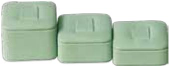
WEDGE SINGLE RING DISPLAY TOP CLIP TO HOLD RING