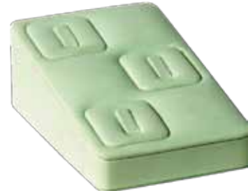
WEDGE STYLE RING DISPLAY TO HOLD THREE RINGS BY TOP CLIPS