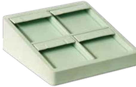
WEDGE STYLE EARRING DISPLAY TO HOLD FOUR PAIR OF EARRINGS

* JAD 050 160mm x 156mm x 48mm sloping to 20mm