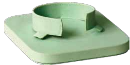
BRACELET BANGLE DISPLAY WITH SPRING CLIP TO HOLD PIECE

* JAD 111 110mm x 110mm x 50mm thickness