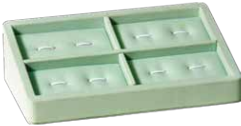
WEDGE STYLE CUFFLINK DISPLAY TO HOLD FOUR PAIRS OF CUFFLINKS

* JAD 040 134mm x 134mm x 48mm sloping to 20mm