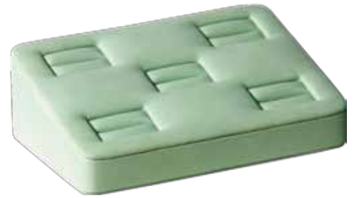
WEDGE STYLE RING DISPLAY TO HOLD FIVE RINGS IN SOFT ROLL INSERTS