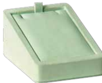
WEDGE STYLE SINGLE PENDANT DISPLAY

* JAD 100 88mm x 88mm x 38mm sloping to 20mm