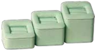
WEDGE SINGLE RING DISPLAY SOFT ROLL TO HOLD RING