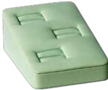
WEDGE STYLE RING DISPLAY TO HOLD THREE RINGS IN SOFT ROLL INSERTS