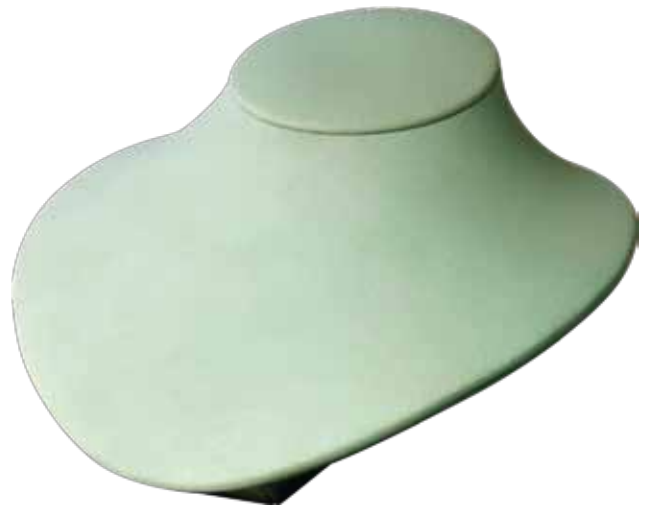
COUNTER NECK DISPLAY WITH REAR CHAIN GUIDE & ADJUSTABLE LOOP CHAIN FASTENER