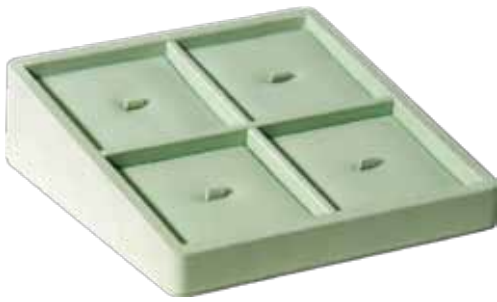
WEDGE STYLE BROOCH DISPLAY TO HOLD FOUR PIECES

For material and product finish options please refer to our material swatch collection and enclosed information sheet.