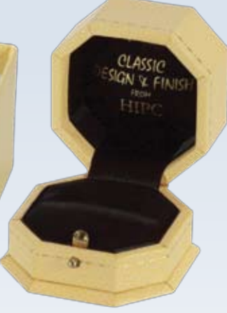
* Z01 SINGLE RING CASE INSERT SOFT ROLL