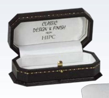
* Z10 PIN CASE