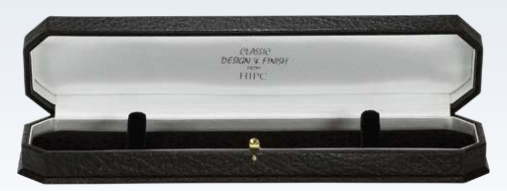
* Z06 BRACELET CASE