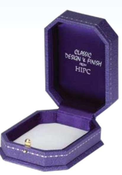
* Z03 PORTRAIT FLAP EARRING CASE