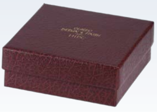
* Z02 UNIVERSAL PENDANT CASE

Please refer to enclosed interior insert design sheet for information relating to case size and insert types available.