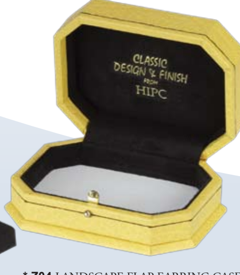
* Z04 LANDSCAPE FLAP EARRING CASE