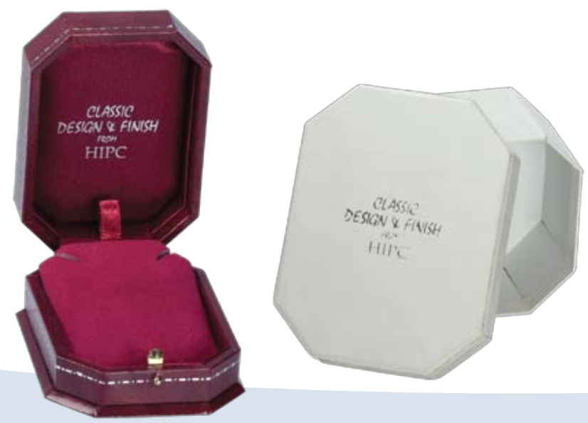
Your own trade mark or logo can be hot foil printed on both the inside & outside lid of the presentation case. Embossing is available on exterior of certain covering materials, please refer to the information sheet.