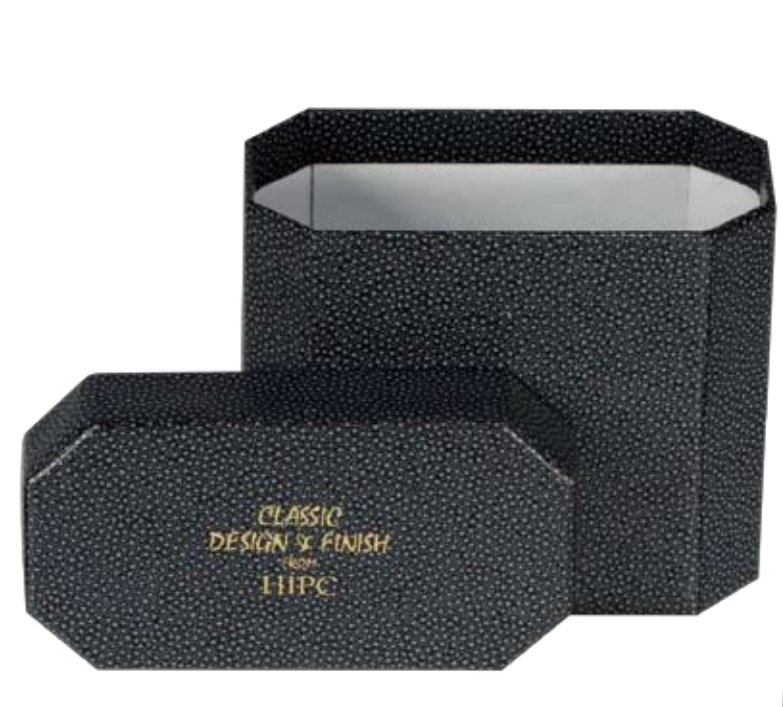
* Z11 DOUBLE DOOR BANGLE CASE