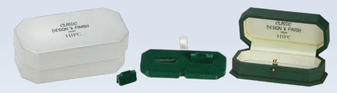
* Z05 CHAIN LINK CASE