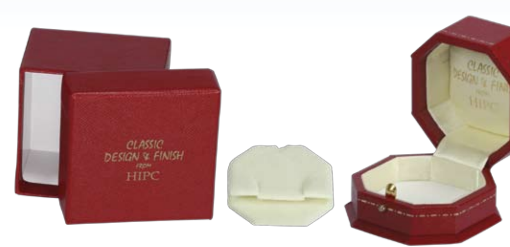
* Z07 SMALL FLAP EARRING CASE